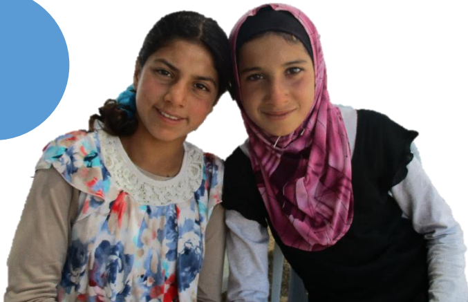
Mission & Service partner: Middle Eastern Council of Churches