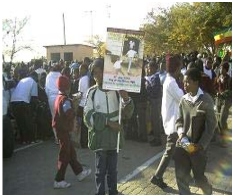
Tshologelong children & youth participate in the activities of June 16 – African Child